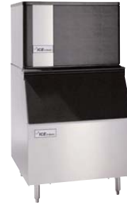
ICE 0606 on a B55 Bin

ICE-O-Matic® is the Best ICE Making Solution for: Hard Water, Food Safety and Tight Spaces